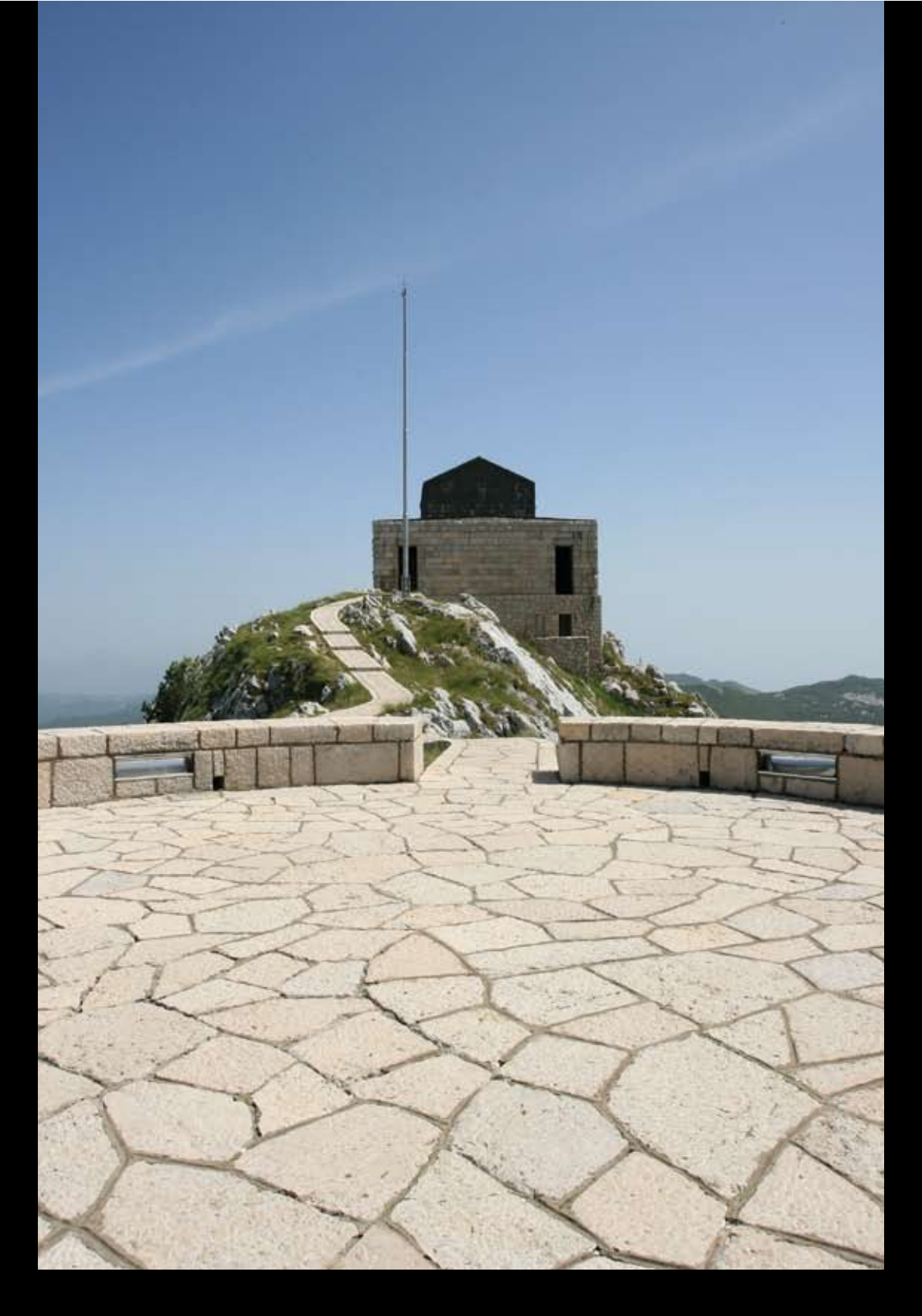
national parks lovcen